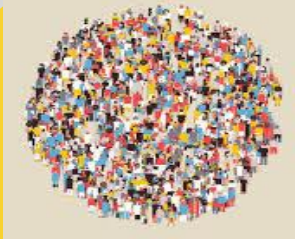
POPULATION – 2,797 MLN.