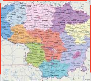
MAP OF LITHUANIA