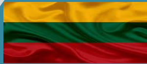
FLAG OF LITHUANIA